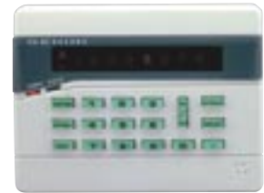
GEM-RP8 supplied with GEMP801/P800