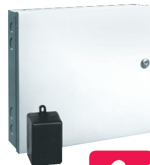
GEM-P801LK, Control Panel less Keypad