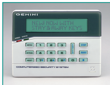
New GEM-RP8LCD Keypad with easy "STAY" & "AWAY" keys.