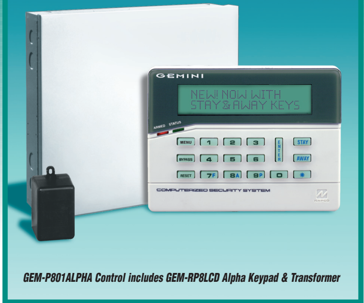
GEM-P801ALPHA Control includes GEM-RP8LCD Alpha Keypad & Transformer