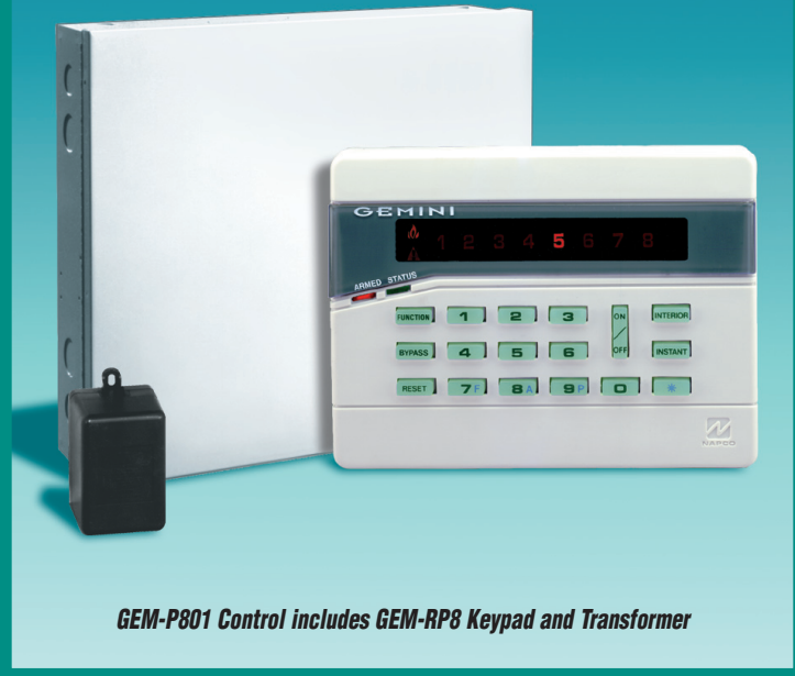
GEM-P801 Control includes GEM-RP8 Keypad and Transformer