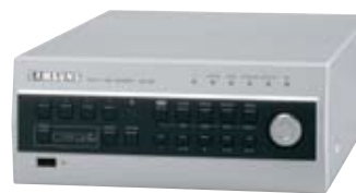
Without CD-RW As SHR-2040