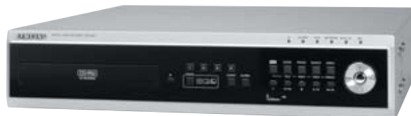
With CD-RW As SHR-2042