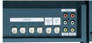
SMC-152F 4BNC Video