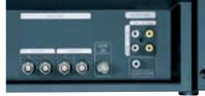
SMC-150F 2BNC Video